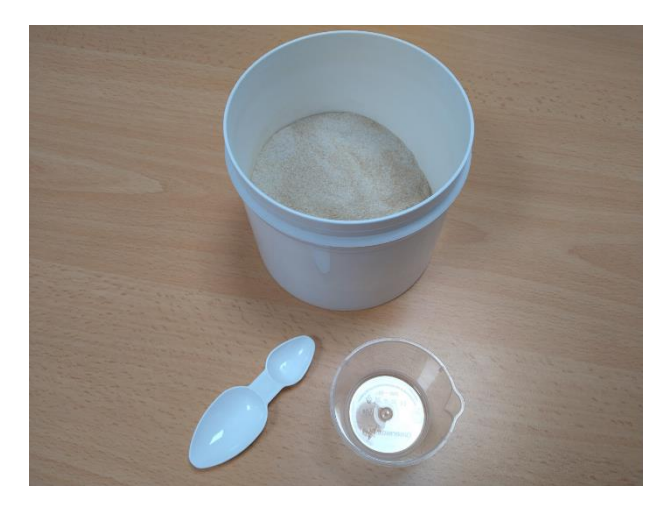
Appendix 2: Guide to making up powdered enzymes (Pancrex® V powder) for administration through a gastric feeding tube (NG,PEG or RIG) for patients who are eating.

Step 1) You will need a medicine spoon, cooled, boiled water and a pot for mixing in.